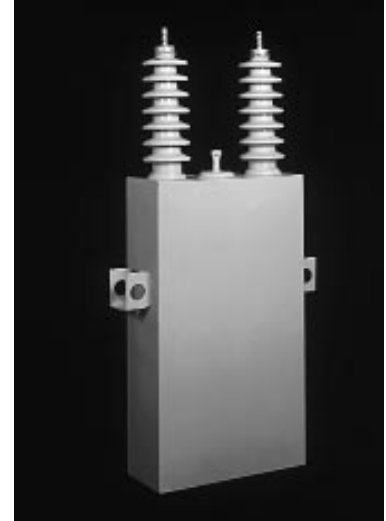
Figure 1. The McGraw Edison EX-7Li® single phase internally fused, all-film capacitor

Single-phase capacitor units are designed to produce rated kvar at rated voltage and frequency within the tolerance of the applicable standard. As the capacitor's kvar output is proportional to the square of the applied voltage, proper application requires attention to the applied voltage.